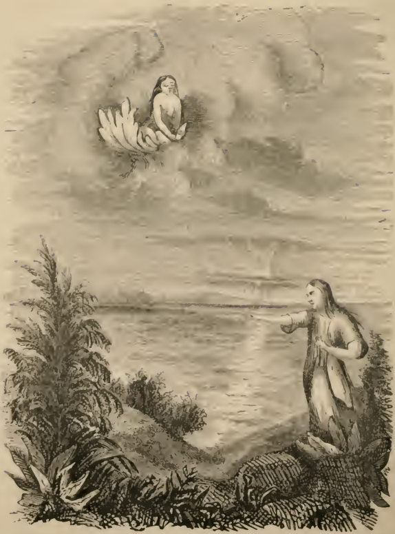
She saw the dark blue sea she left so long ago.